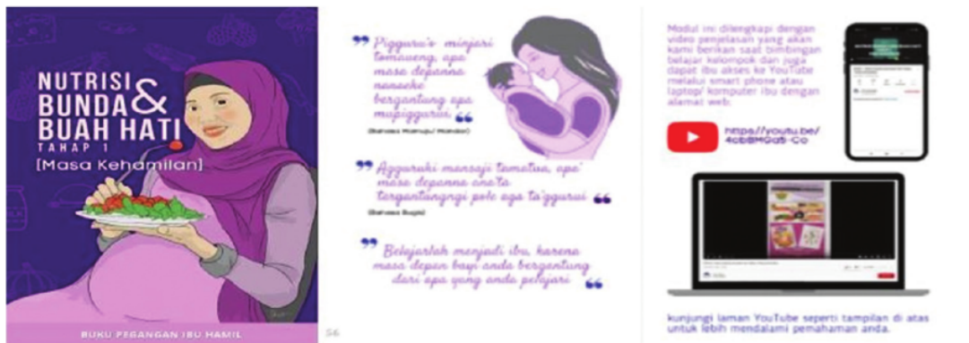
Figure 2: The qualitative data of media experts